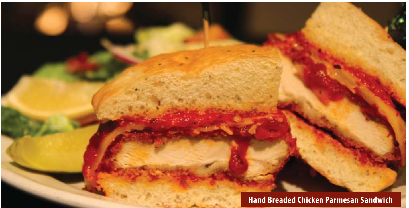
Hand Breaded Chicken Parmesan Sandwich

A hand breaded chicken breast topped with our house marinara, sliced tomatoes and an Asiago Parmesan cheese blend. Served on toasty fresh Herb Focaccia loaf. $10.95