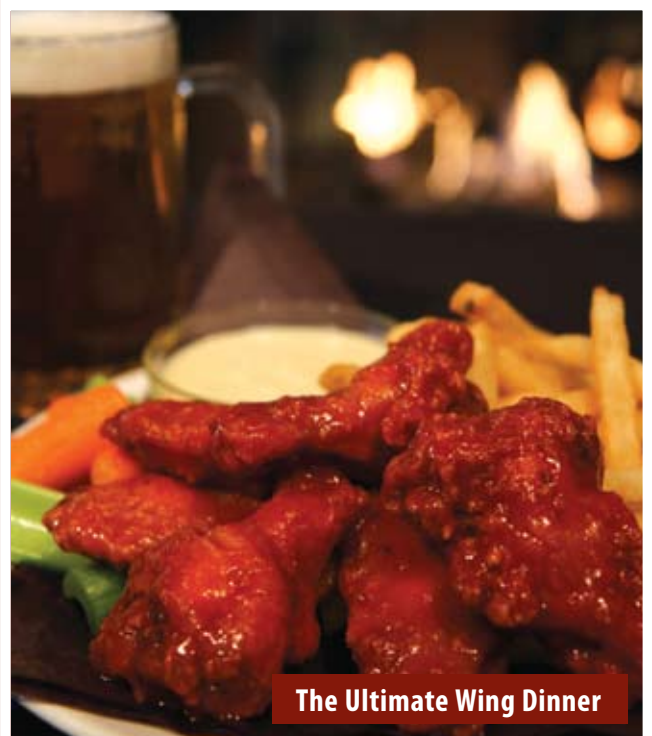
The Ultimate Wing Dinner

Our classic Breaded Chicken Fillets rolled in our signature Buffalo sauce, served on a bed of our Classic fries with a side of ranch for dipping. $9.49