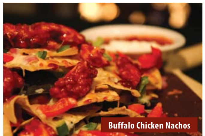
Buffalo Chicken Nachos

Can't decide which fries you'd like? Don't fret! The Trio comes with Sweet Potato Fries, Poutine and Kettle Chips. $6.49