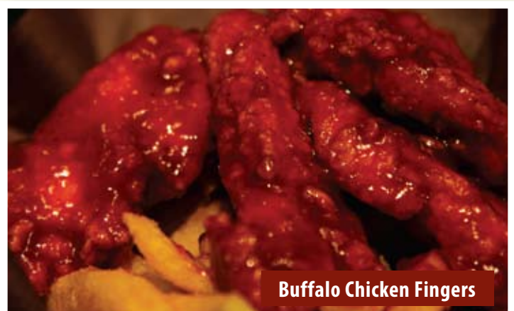
Buffalo Chicken Fingers

A combination of our award winning Chicken wings and our classic fries. Served with crispy veggies and blue cheese dressing. You can't go wrong with this one! $9.49.