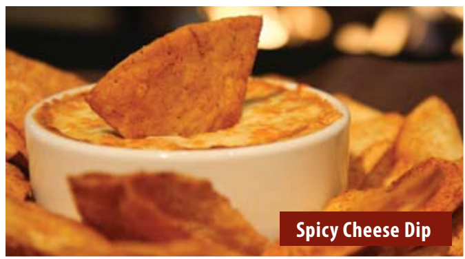
Spicy Cheese Dip

Can't decide? Why not pick 3 items and try them all! Choose from Garlic Bread with Cheese, Bruchetta, Kettle Chips, Sweet Potato Fries, Veggies and Dip, Perogies, Deep Fried Pickles, Onion Rings or our House favorite Antojitos. $17.50