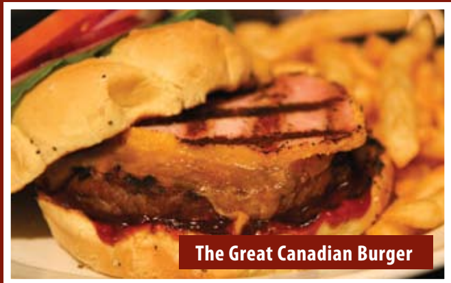
The Great Canadian Burger

Nothing says Canadian more than this burger, A 6 oz. Bison burger smothered in Maple BBQ sauce and topped with grilled peameal bacon, Canadian Cheddar cheese, lettuce, tomato and red onion slices. $10.95