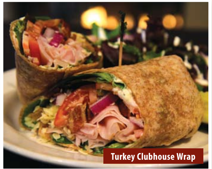
Turkey Clubhouse Wrap

A whole wheat tortilla brushed with pesto mayo and layered with baby greens, grilled vegetables and topped with Canadian feta cheese. $10.95