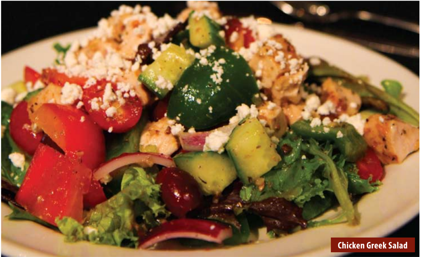
Chicken Greek Salad