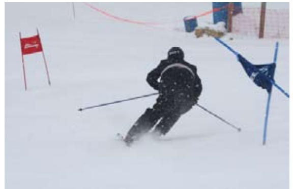
CHICOPEE RUNS A LEVEL 1 OFFICIALS COURSE EACH FALL. THIS IS A RECOMMENDED TRAINING SESSION FOR TEAM MANAGERS

(3) If in your opinion and the coaches opinion the race course in any way presents a safety hazard make your objections known to the chief of race before signing off on the inspection